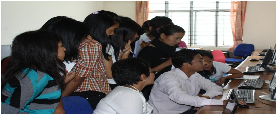
Class with trainees