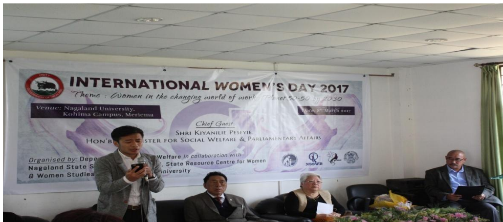
A special Song