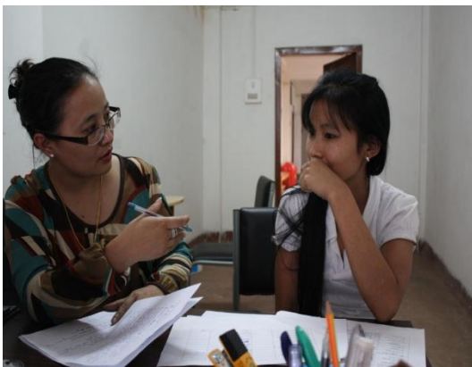
One on One Interaction with trainees.