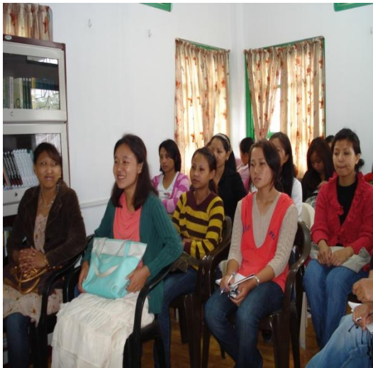
A section of ESD trainees