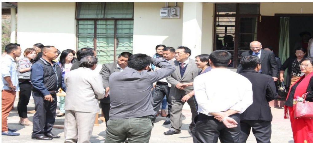
A section of the crowd