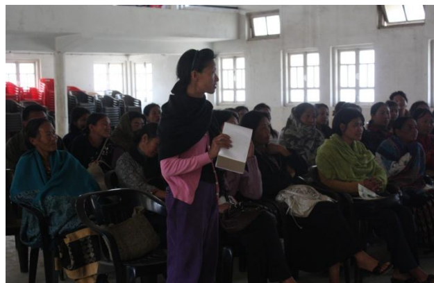
Queries from the participants