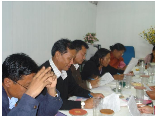
Consultative discussions with Sumi tribe