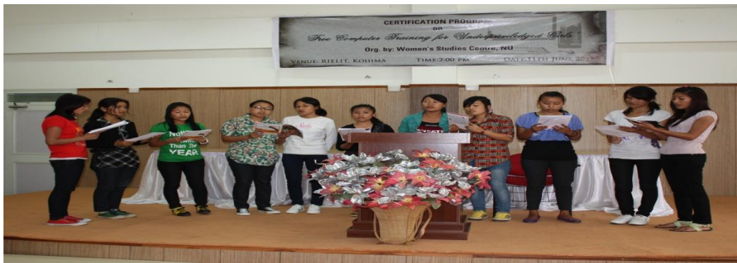
Trainees presenting a special song during certification program