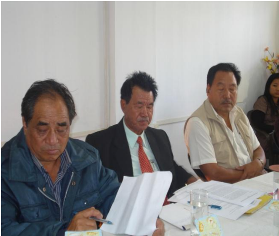
Consultative discussions with Lotha tribe