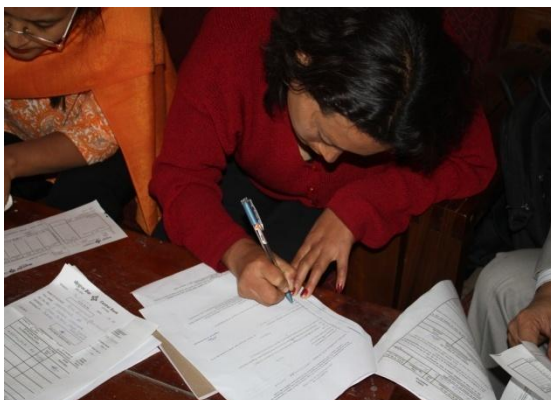
Opening of bank accounts