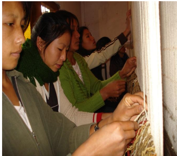
Trainees at work