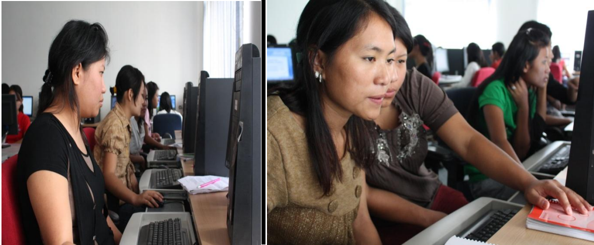
Classes on with various Resource Persons