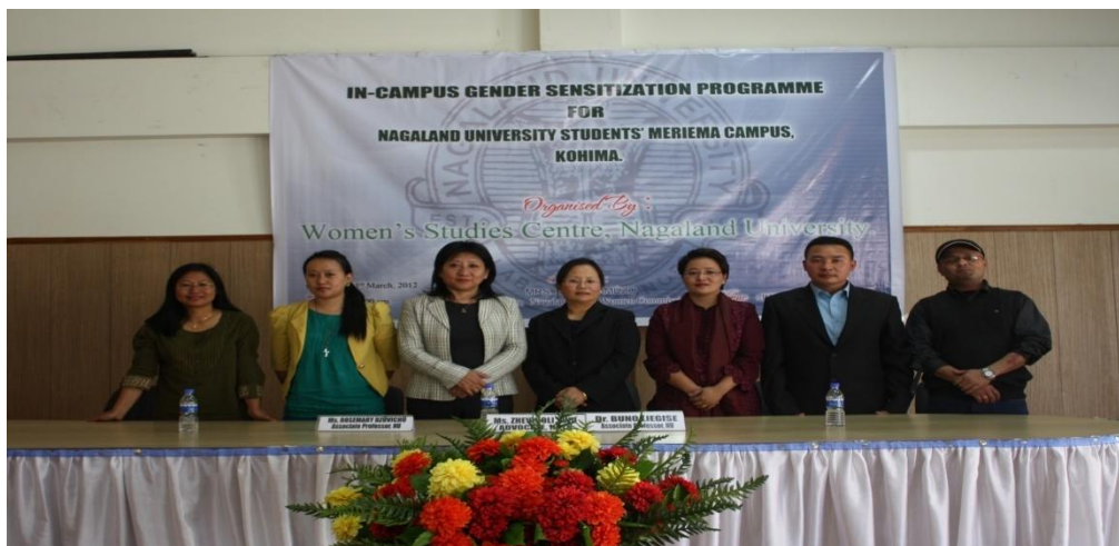
Group photo with the Resource Persons.