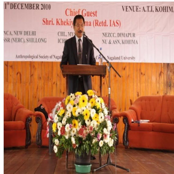
Shri. Khekiye Sema (Retd IAS)