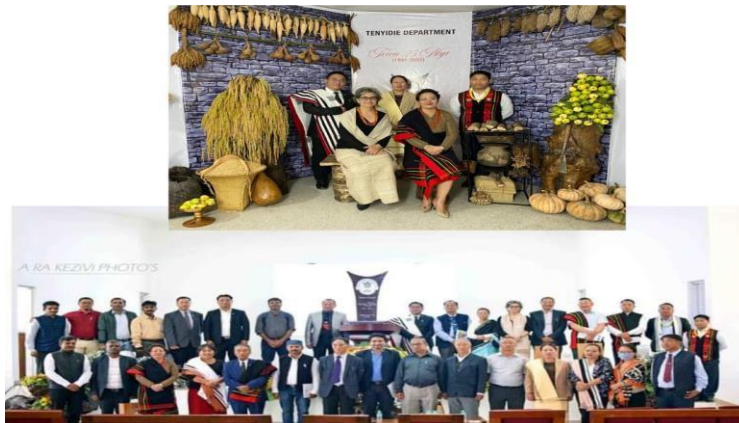
Silver Jubilee Celebration of the Department of Tenyidie.

One day celebration to mark its Silver Jubilee Year under the theme “DIEUCHAU” - a confluence of Literature, Art, Music, and Culture held on 15 th October, 2022