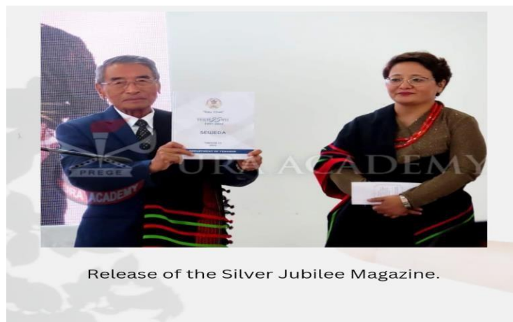
Release of the Silver Jubilee Magazine.