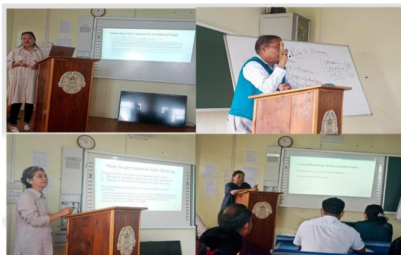
Two Days Workshop on Research Methodology

Two Days Workshop on ‘Research Methodology for Faculty and Scholars’ on the 6 th - 7 th October, 2022.